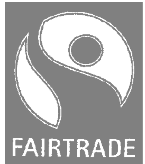
Fairtrade logos, new and old