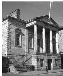
Slave Traders paid their taxes at the building that is now the Maritime Museum